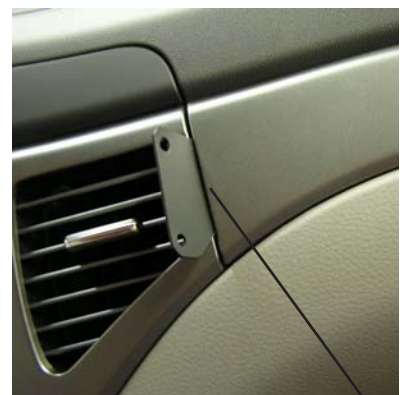
Note minimal gap by mount