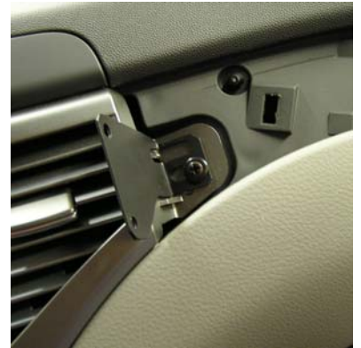
Prototype of Part A mounted in place

ENJOY YOUR NEW INDASH by PANAVISE MOUNT.