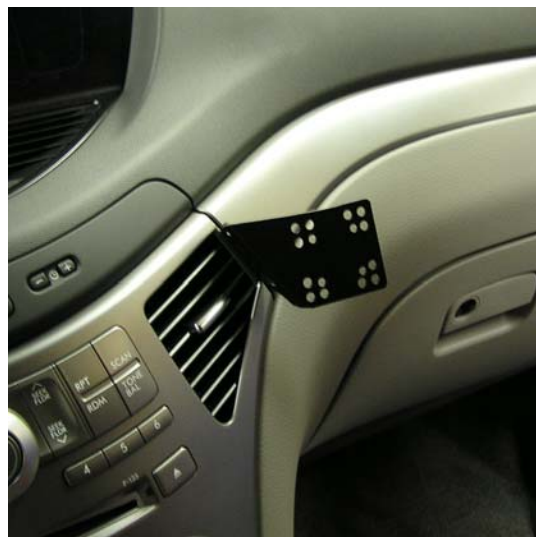
InDash installed showing location