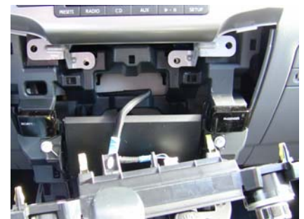
Climate Control removed showing radio screws location