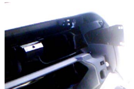
Bottom piece mounting location